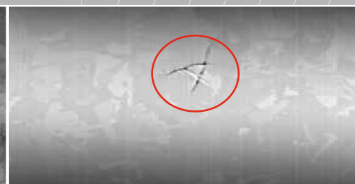
▤ Crack inspection (solar wafer)